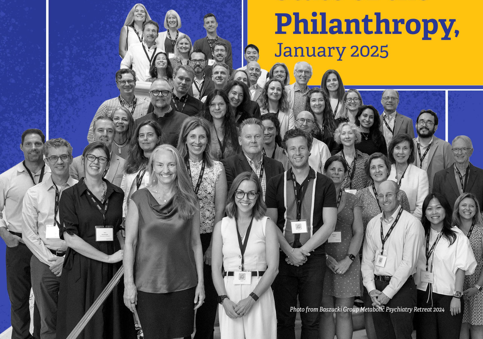
Photo from Baszucki Group Metabolic Psychiatry Retreat 2024